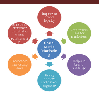
Fig: 1. Depicting Social Media Marketing Benefits

These benefits had made social media as the integral part of online business. Social media tries to give the opportunity to develop a healthy relationship with the customers and learn about positive and negative experiences that the company had with their products or services and further make improvements to the key areas of their business.